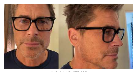
"HE IS A HEARTROB"