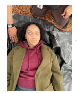
"She loo so dead."